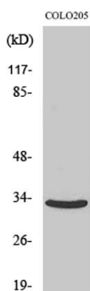
Western Blot analysis of various cells using CB2 Polyclonal Antibody

receptor 1 (brain) (CNR1) gene have the characteristics of a guanine nucleotide-binding protein (G-protein)-coupled receptor for cannabinoids. They inhibit adenylate cyclase activity in a dose-dependent, stereoselective, and pertussis toxin-sensitive manner. These proteins have been found to be involved in the cannabinoid-induced CNS effects (including alterations in mood and cognition) experienced by users of marijuana. The cannabinoid receptors are members of family 1 of the G-protein-coupled receptors. [provided by RefSeq, Jul 2008],